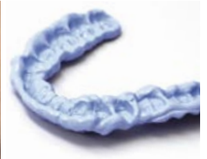
Final bite registration