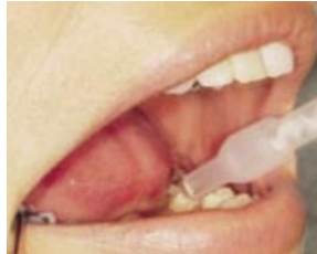
Application of Jet Blue® Bite fast