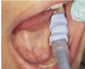
Direct application with the unique Spreader Tip